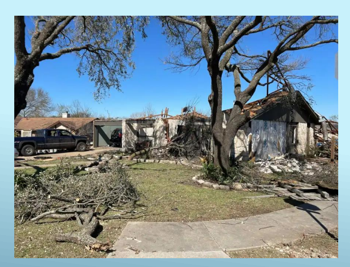
The front of Talamantez' home in Round Rock after a tornado came through on March 21, 2022.

Lion Cathy Petross has answered the call for a volunteer to head the effort to collect items that are needed for the recovery from the Tornado that ravaged parts of Round Rock recently. PLEASE BRING YOUR DONATED ITEMS TO THE APRIL 5 MEETING.