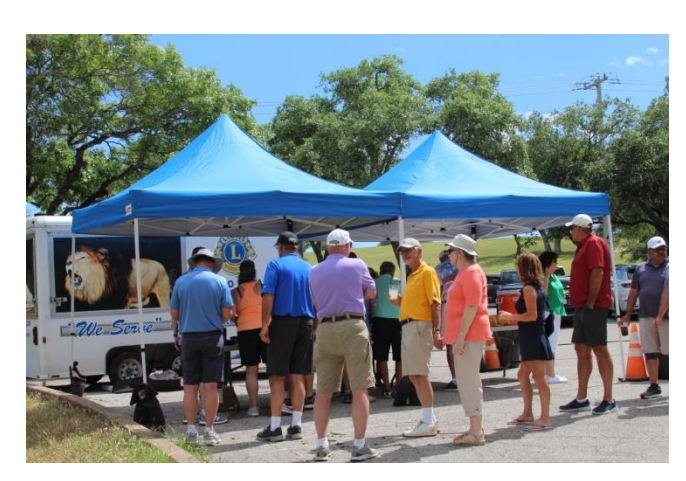
A long line of golfers waiting for their BBQ dinner