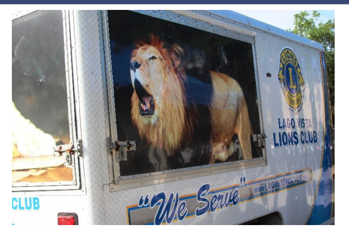
BBQ Concession Trailer