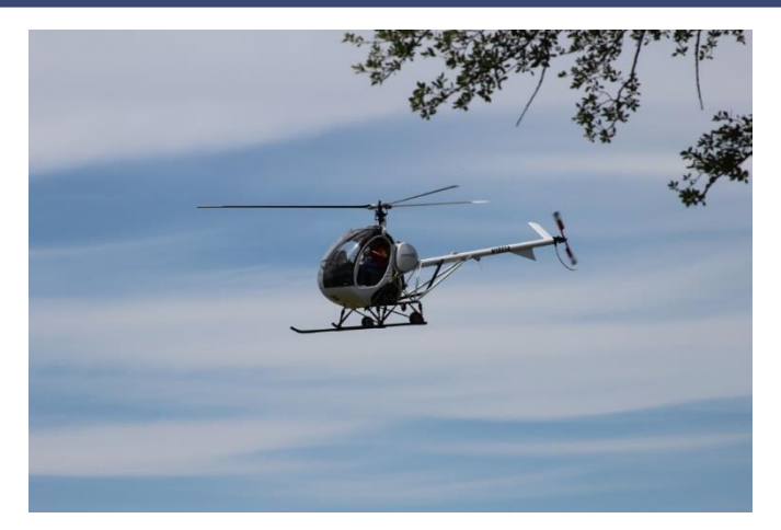
Golf Balls were dropped by helicopter