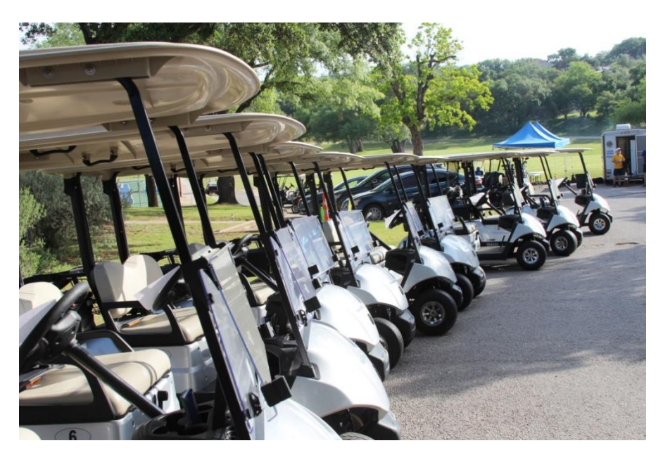
Pre-Tournament Cart Staging