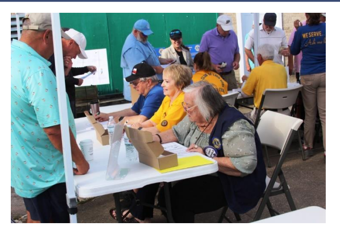
Registration Desk was very busy