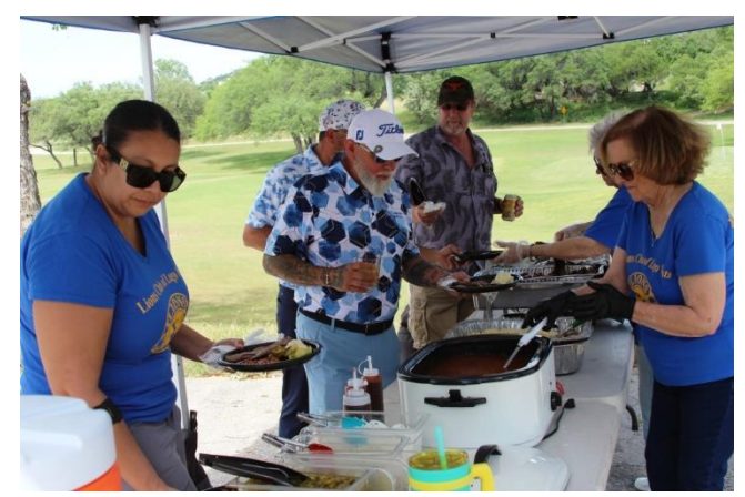
BBQ Serving Line