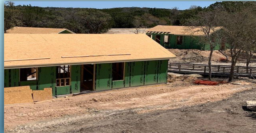
Some of the 12 cottages being built on Eagle Trail.