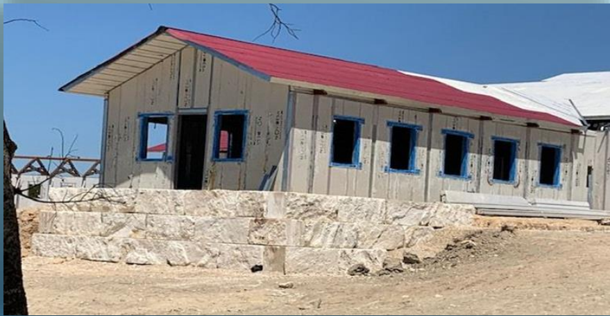
One of the bunkhouses being built on the main campus.

Work continues to rebuild two bunkhouses and the expansion of Eagle Trail to include cottages. There are also naming opportunities right now for buildings, furniture, cottages, baths, etc. for a substantial contribution to the camp. You can find more information at www.lionscamp.com . Here are a couple of pictures of the progress.