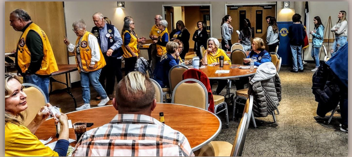
The line was long, but with good reason!

Our world renowned BBQ team brought the magic of their prowess to us once again as we celebrated a very well attended meeting with gratitude and appetite! We welcomed the new group of Leos who were lucky enough to join us for a fabulous meal of pork loin, sausage and all the traditional sides. Thank you BBQ team!